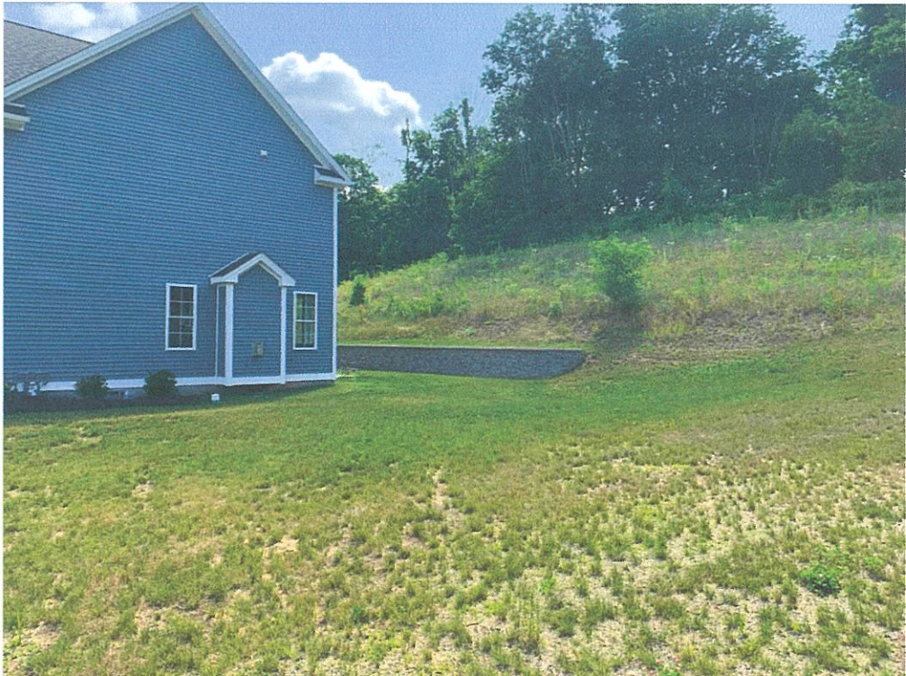
Exhibit 4: View From Front-Right Portion Fence